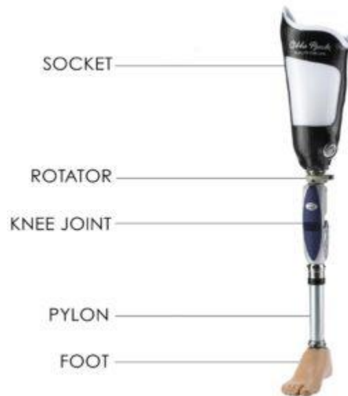
Figure 3. Elements of a limb prosthesis